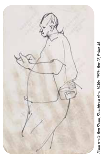
Original sketch from American artist Ben Shahn, best known as a social realist. Digitized on a Zeutschel overhead book scanner utilizing PerfectBook curvecorrecting software.

time and with more than 1.5 million available in online collections, AAA has made significant progress toward this goal.