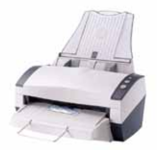
Support plastic cards scanning (front-feed)