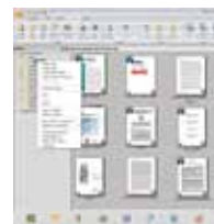
The PaperPort SE 14 main screen

- The Professional Choice to Organize and Share Your Documents