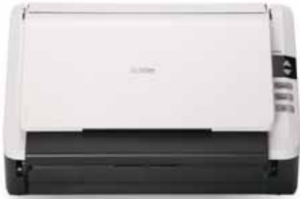
Input and output paper tray can be fold when not in use.