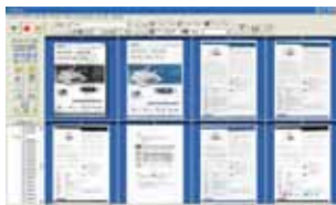
The AvScan 5.0 main screen

-The Intelligent Document Management Tool