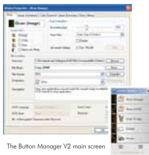
The Button Manager V2 main screen

Button Manager V2 makes it easy for you to scan and send your image to your favorite destinations with a press of one button. Now the new version comes with an innovative feature to let you scan and automatically upload the scanned document to popular cloud repositories such as Google Docs, Microsoft SharePoint, or FTP. In addition, the iScan feature allows you to insert the scanned image or recognized text after optional OCR (Optical Character Recognition) process to your text editor such as Microsoft Word to get your job done easily and quickly.