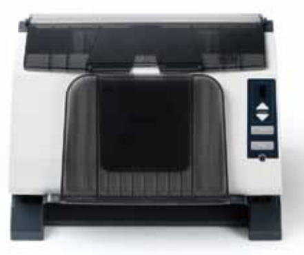
Input and output paper tray can be fold when not in use.