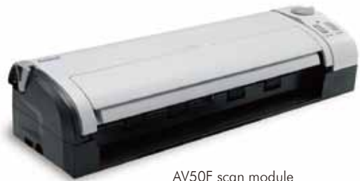
AV50F scan module