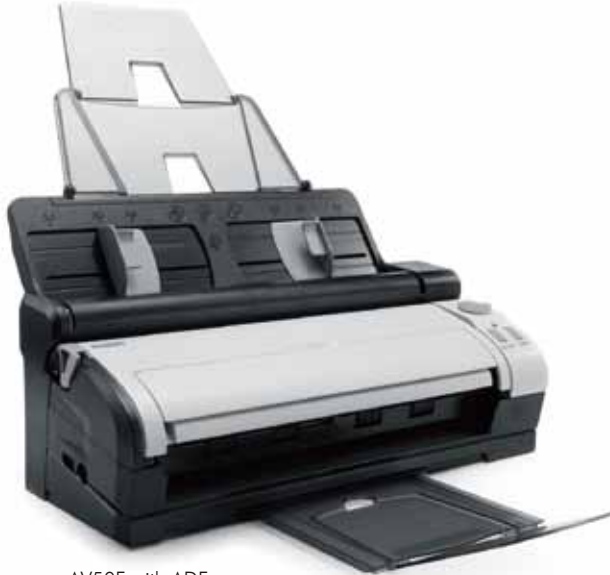
AV50F with ADF