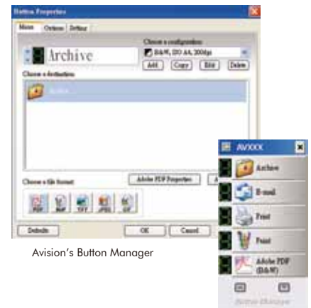
Avision's Button Manager

The Avision AV50F scanner comes with TWAIN and ISIS drivers and is also bundled with full version of exclusive Avision Button Manager, ScanSoft PaperPort, Avision ScanPortfolio, WorldCard.