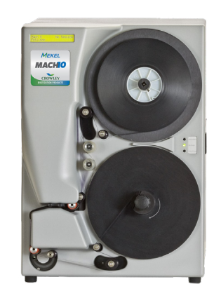
MACH10 and the MACH Mini Film have a true optical dpi range of 100-600; speeds vary depending on dpi.

The MACH Mini Film, introduced in 2019, harnesses the image quality, editing features and efficiencies of the larger MACH models in a smaller footprint. Digitizing up to 500 images per minute at 200 dpi, the MACH Mini Film is portable and stackable, adding versatility to the MACH-Series product line.