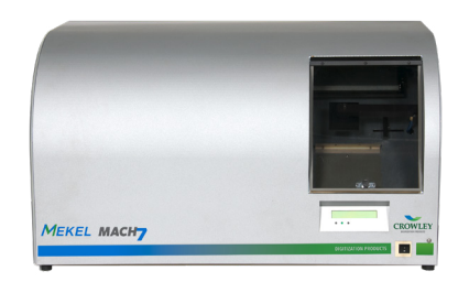
Digitizes up to 200 images per minute and captures all microfiche and aperture card formats

image capture, MACH-Series microfiche scanners employ a separate prescan and title bar camera used for image location. With this unique configuration, the scanners skip the blank spaces on a fiche that is not full, allowing