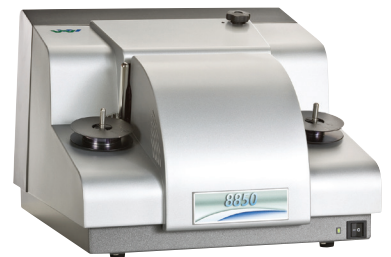
8800-Series Microfilm Scanner

By separating the capture process from the QA routine, VSS optimizes the creation of digital images from microfilm and microfiche. Flexible enough to integrate with existing workflows, VSS provides a powerful toolkit that allows every image scanned to be checked and adjusted before outputting a final saved image. The VSS solution enables the speed of the scanner to be maximized at all times, while the throughput of the QA process is adjusted quickly and easily according to demand.