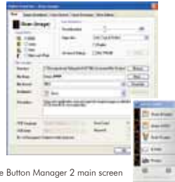
The Button Manager 2 main screen

Button Manager 2 makes it easy for you to scan and send your image to your favorite destinations with a press of one button. Now the new version comes with an innovative feature to let you scan and automatically upload the scanned document to popular cloud repositories such as Google Docs, Microsoft SharePoint, or FTP. In addition, the iScan feature allows you to insert the scanned image or recognized text after optional OCR (Optical Character Recognition) process to your text editor such as Microsoft Word to get your job done easily and quickly.