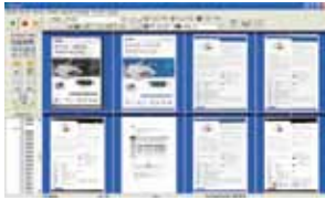
The AvScan 5.0 main screen

Document Imaging is the very first step of Document Management. However, poor quality images can cause serious problems to later indexing or storing processes. It may increase scanning labour costs and lowers the OCR accuracy. AvScan 5.0 ensures all documents are checked and polished at the time they are scanned such that the image quality is guaranteed before they are ready to use for other purposes.