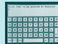
Keyboard input for individual indexing and process control.