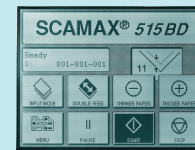
Freely definable key assignment.