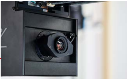
Camera system with a CMOS-based line sensor