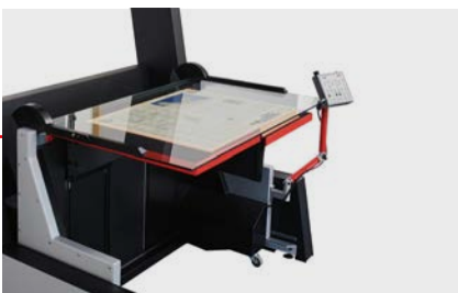
Wide range of interchange- able imaging systems