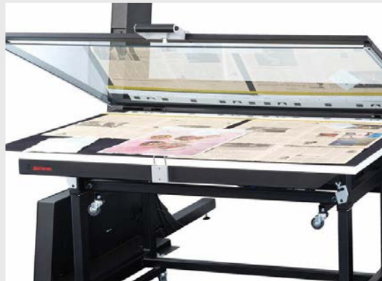
Toplight Table AT 0 with opened glass plate