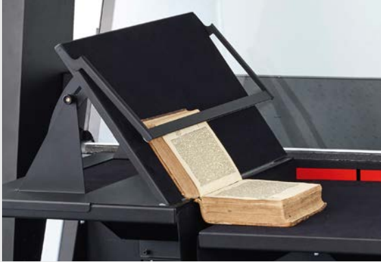
Bookholder on Copyboard OT 180 H 35 XL700